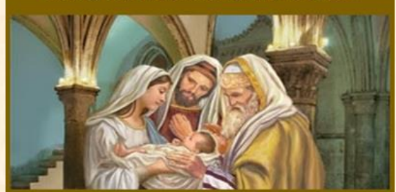
Feast of The Presentation of The Lord Jesus

The prophecy of Malachi (First Reading) is fulfilled when Mary and Joseph present the child Jesus in the Temple, for Malachi speaks of a day when 'the Lord . . . will suddenly come to his Temple'. The Gospel serves as a formal announcement of Jesus's arrival in the Temple: his presentation to Gentiles and Jews alike, as 'the salvation' of all humankind. The intimate scene also highlights the faithful piety of the young couple, as well as the patient faith and hope of Anna and Simeon.