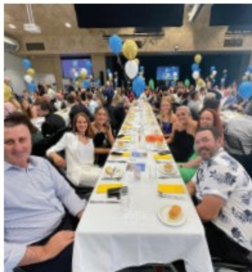
Class of 2022 Graduation evening

It also provided an opportunity to collaborate with an initiative of the Sacred Heart Parish Pastoral Council to celebrate a First Nations Peoples Mass which was used as a vehicle to commission the pilgrims (staff and students) who were participating in the Immersion Program.