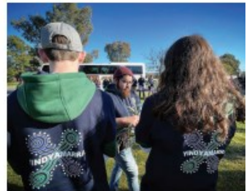
2022 Immersion Program smoking ceremony

Once again it was something small that was done with love - something simple that was done well or even great. That is what we are all about here at Xavier, teaching our students to do the little things and be a part of a Catholic faith community. These experiences are provided as part of our shared