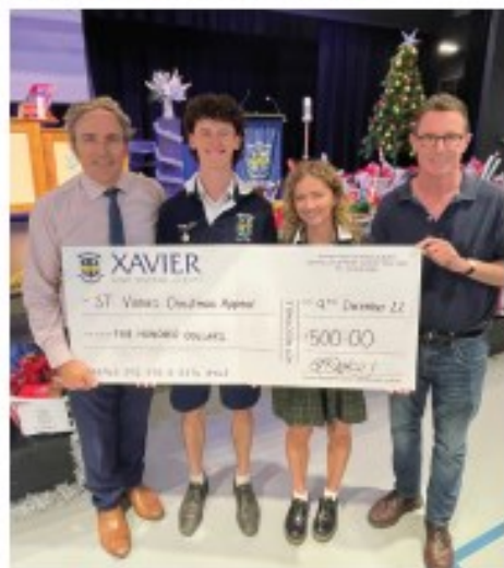
Donating to St. Vincent de Paul North Albury

In our last article we mentioned the strong start to our year with the Year 12 Retreat and Year 7 Camp - the bookends of our Faith Formation program.