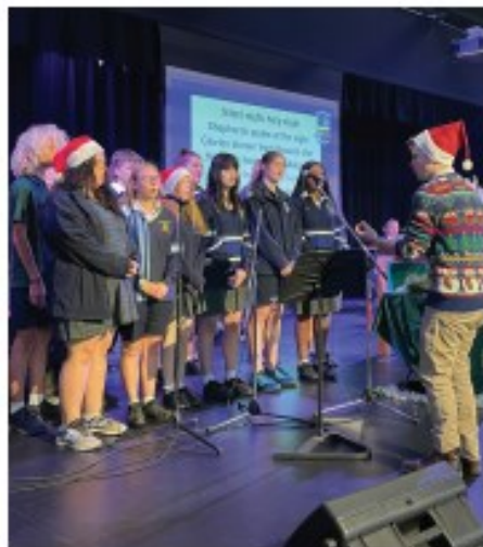
Xavier Choir on stage for the Gift Giving Mass

Our staff also continued to be a light for others. Over a dozen staff members were directly involved in the local Sacred Heart Alpha program . We also conducted two Twilight Spirituality Sessions after school focusing on why our faith calls us to serve our community, followed by putting our faith into action by doing workshops designed to facilitate acts of service for Caravan and the St Vincent De Paul Society.