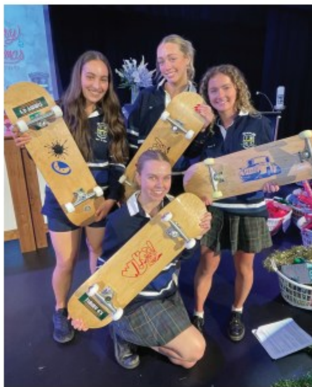
Hand-made skateboards donated as a part of the Christmas Appeal

It also provided an opportunity to collaborate with an initiative of the Sacred Heart Parish Pastoral Council to celebrate a First Nations Peoples Mass which was used as a vehicle to commission the pilgrims (staff and students) who were participating in the Immersion Program.