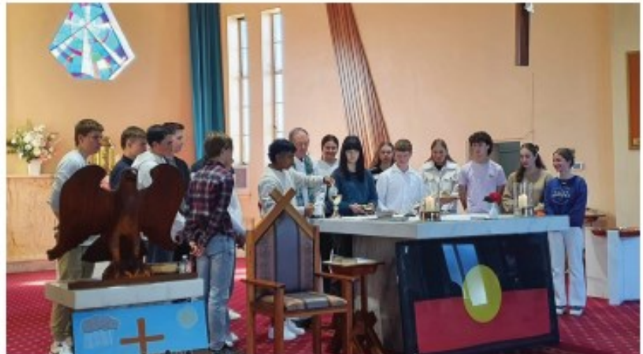
Commissioning Immersion Program participants at the Sacred Heart First Nations Peoples Mass

Then there was our big finish. Our Gift Giving Mass on the last day for students was the culmination and celebration of our St Vinnies Christmas Appeal. A fundraising initiative we conducted throughout Term 4 where all 32 homerooms created a hamper each of food and decorations for families in our local community. These Hampers also included handmade gifts from our staff which were created on our Twilight night. These were wooden carved candle holders as table decorations and over 125